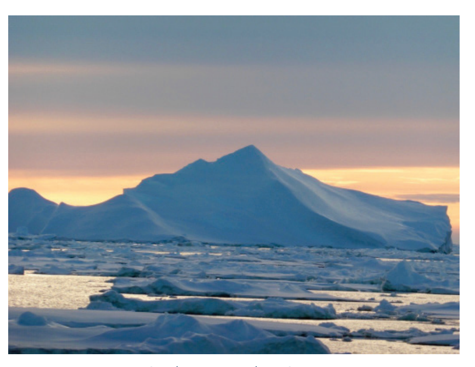
Southern Hemisphere Sunset

those who do not desire bad luck on an upcoming voyage to the Antarctic. And bad luck we were mostly able to avoid; though there were some lingering instrumentation issues as we departed, preparations were finalized and everything - everything was tied down as we moved through the Straits of Magellan and into the 25+ foot waves of the Drake Passage.