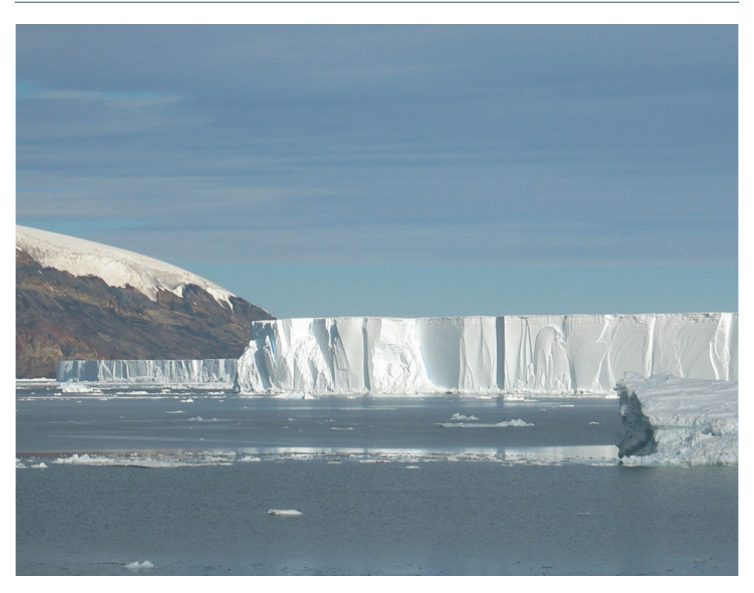
Fig. 1- Iceberg B15 which calved from the front of the Great Ice Barrier (Ross Ice Shelf) in March 2000.

Dinniman , M.S. , J.M. Klinck , L-S Bai, D.H. Bromwich, K.M. Hines and D.M. Holland, The effect of atmospheric forcing resolution on delivery of ocean heat to the Antarctic floating ice shelves. Journal of Climate , 28, 6076-6085, doi:10.1175/JCLI-D-14-00374.1, 2015.