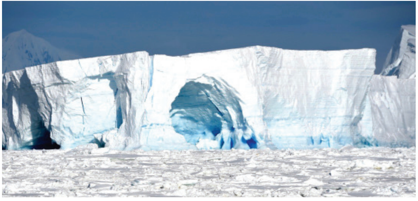
Thick sea ice occasionally prevented coring.

But once unloaded, we were all up, and there was plenty of work to be done. My primary domain was in the cold van, which is more or less a storage unit kept 1-3° C to mimic the ocean floor. Here, Chris and I sectioned cores in a glovebag (a large plastic bag with built-in gloves) under a constant flow of nitrogen, which prevented any iron from oxidizing and precipitating. Each section of mud was carefully labeled by depth from the surface, centrifuged, and the pore waters extracted.